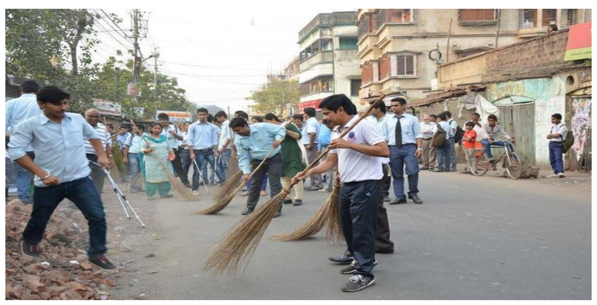
Students participating in Swacch Bharat Abhiyaan conducted on 20-07-15