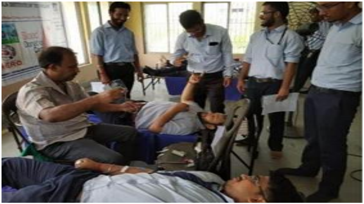
Glimpses of Blood Donation Camp conducted on 22-04-16