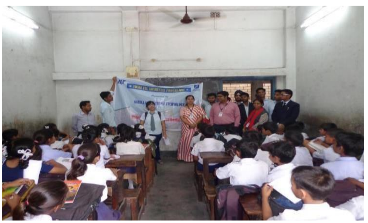
Glimpses of Swine Flu Awareness Program conducted on 23-09-15