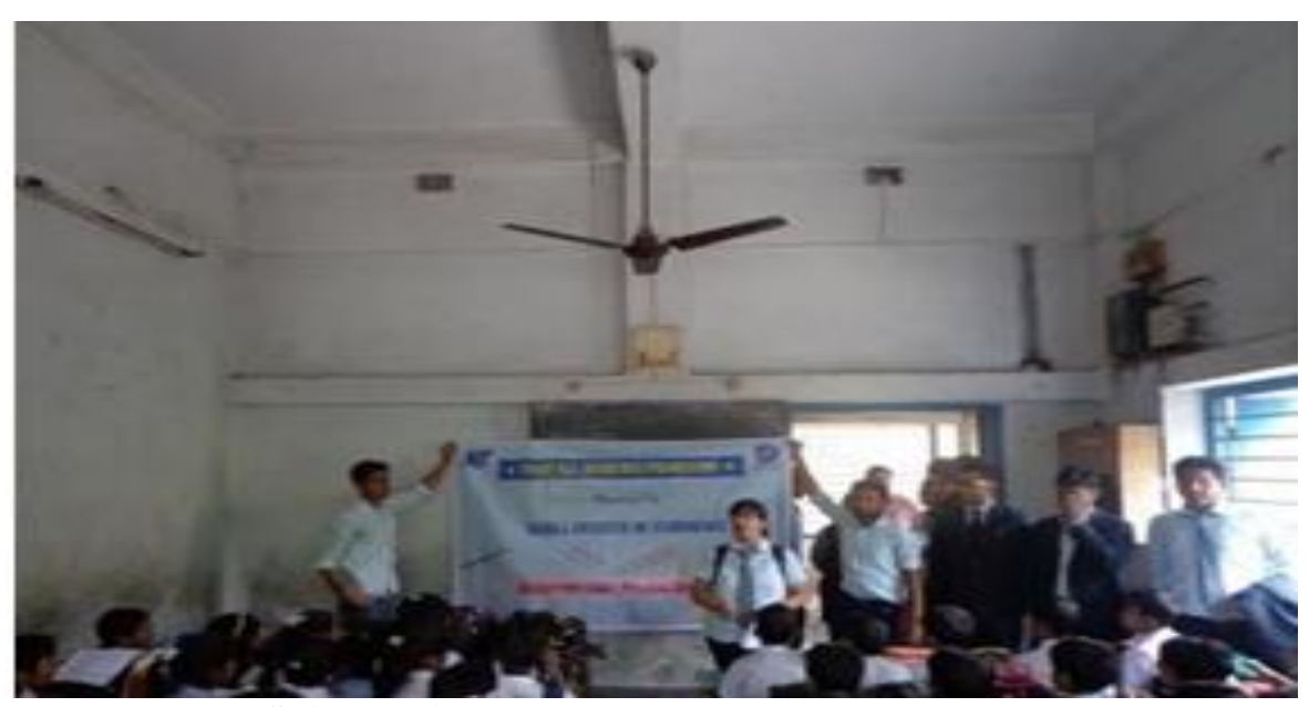
Swine Flu Awareness Program conducted on 23-09-15