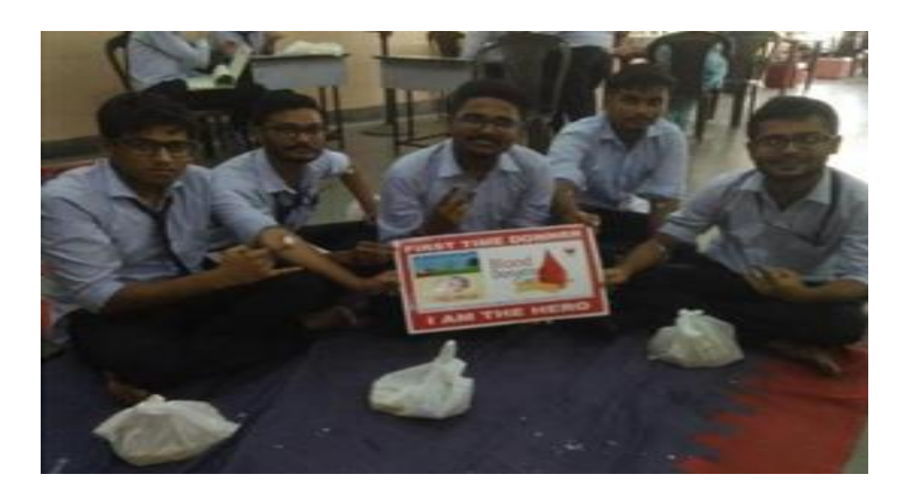
Glimpses of Blood Donation Camp conducted on 22-04-16